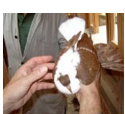
Josef Roth's baby red fullhead swallow